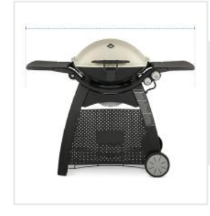
2. Width: Width of the Grill Cover for Weber Q 3200 Gas Grill

3. Depth: Depth of the Grill Cover for Weber Q 3200 Gas Grill