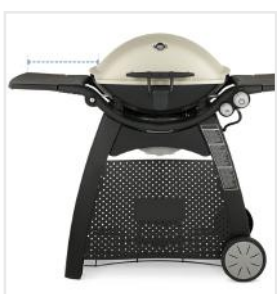
4. Left Shelf Width: Left Shelf Width of the Grill Cover for Weber Q 3200 Gas Grill