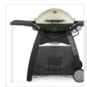
6. Shelf to Ground: Shelf to Ground of the Grill Cover for Weber Q 3200 Gas Grill

We encourage you to upload the image of the article you need the cover for - this helps our team ensure covers are designed keeping your requirements in mind.