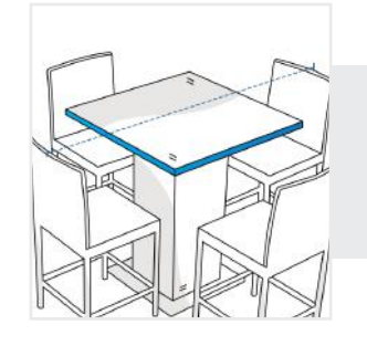
2. Width: Arrange the chairs and measure Width

3. Depth: Arrange the chairs and measure Depth